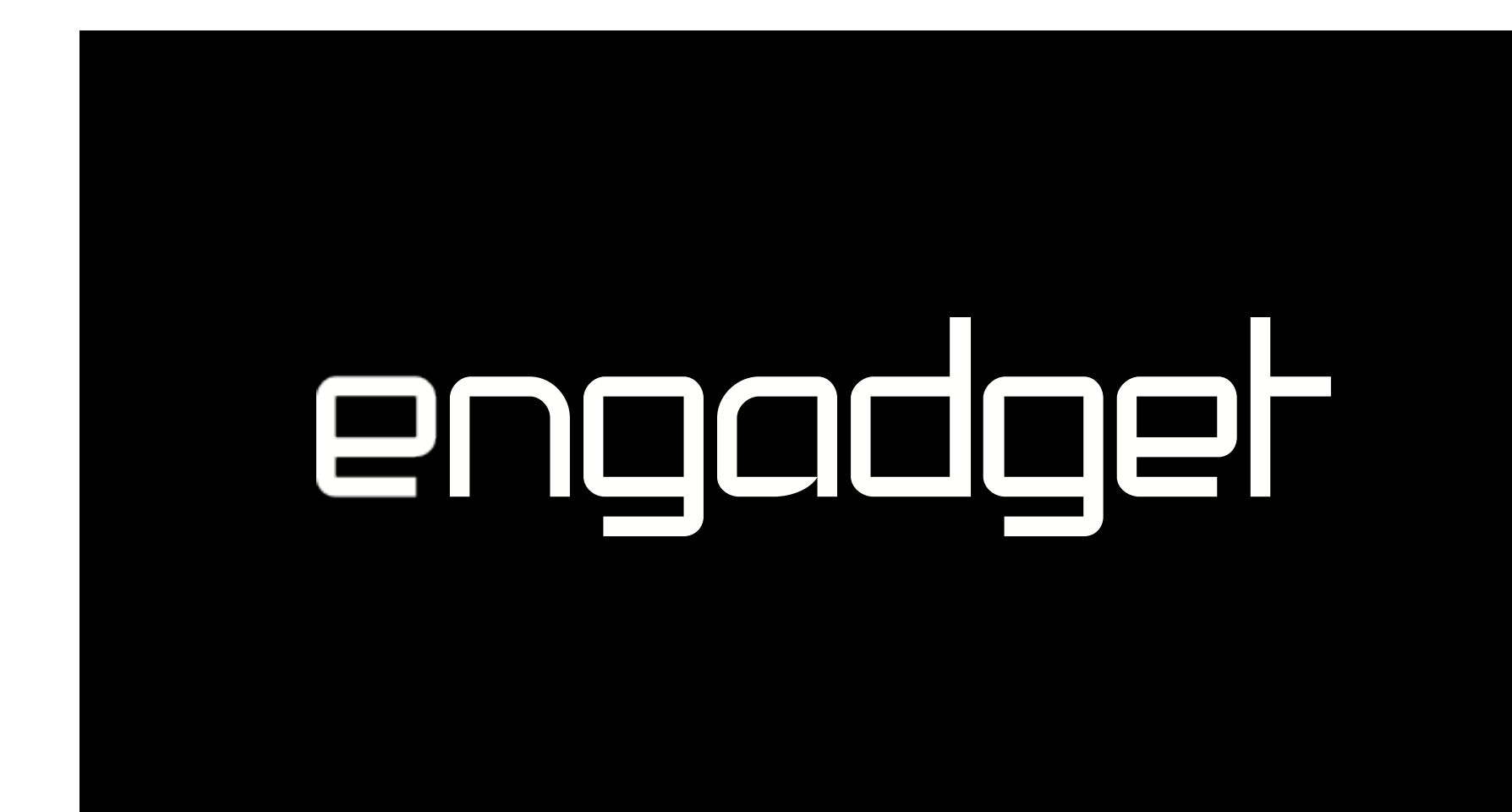
1 COLOR, KO / REVERSAL OUT OF 100% BLACK