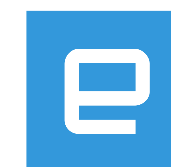
Icon/Favicon for use on colored bg E